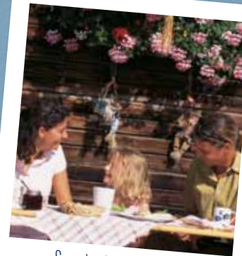
Snack time on the mountain pasture