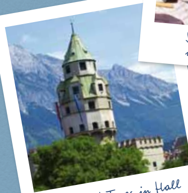
The Mint Tower in Hall