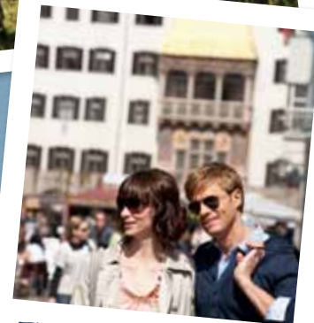
The Golden Roof in Innsbruck